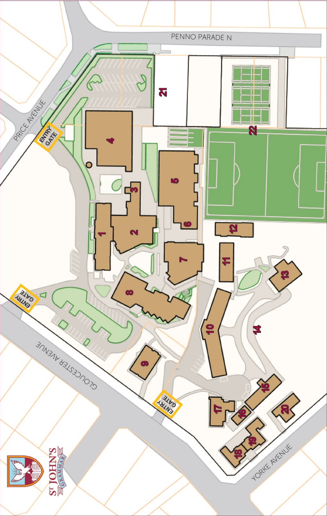
ST JOHN'S GRAMMAR SCHOOL SECONDARY CAMPUS MAP